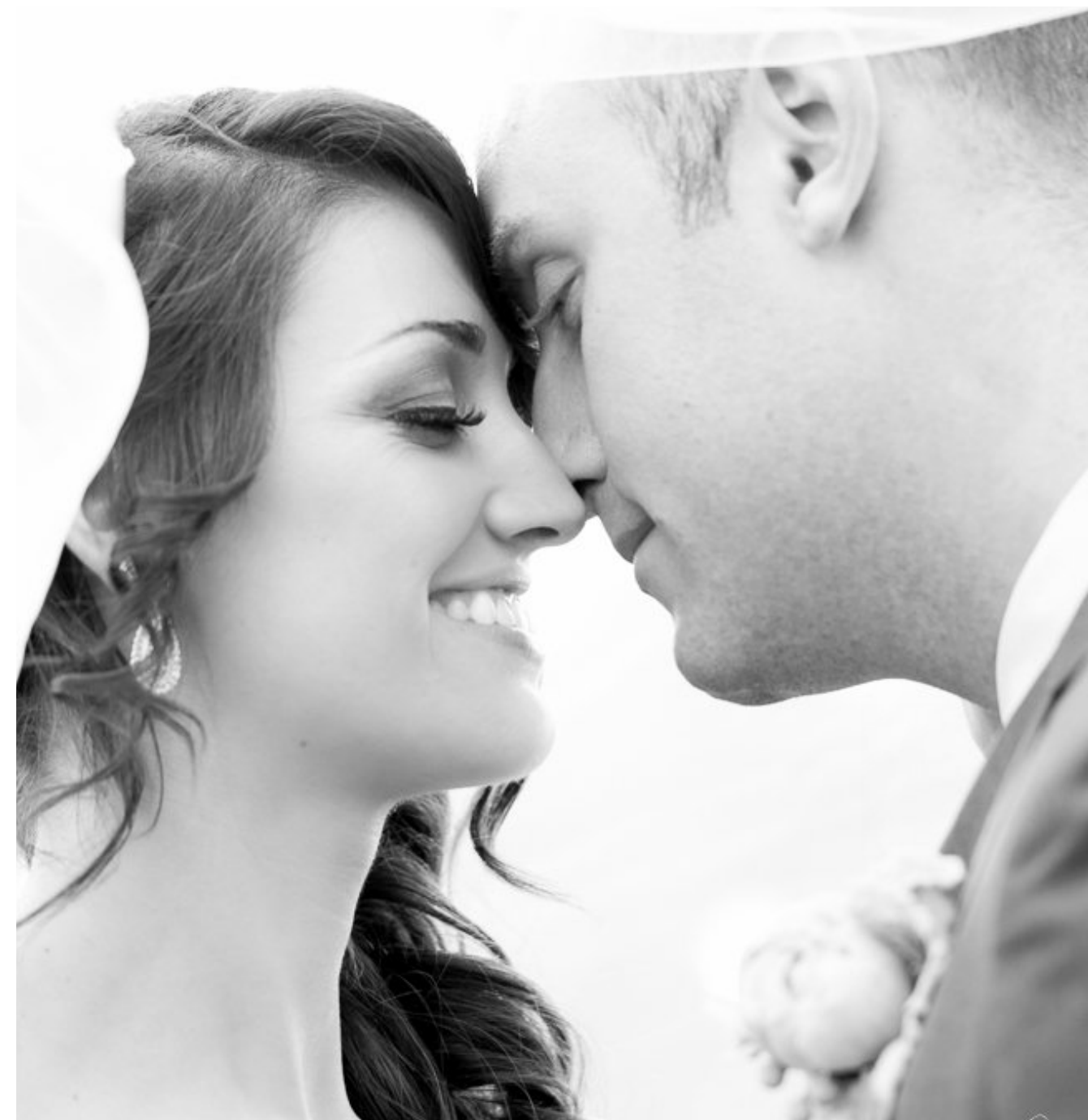
Elena and Eric focused on the happiness of the day while Arthur's took care of all the delicious details. Opposite: A Caribbean salad, drizzled with a passion fruit vinaigrette, combined island flavors with baby greens, strawberries, mangoes, crumbled gorgonzola, and caramelized pecans.