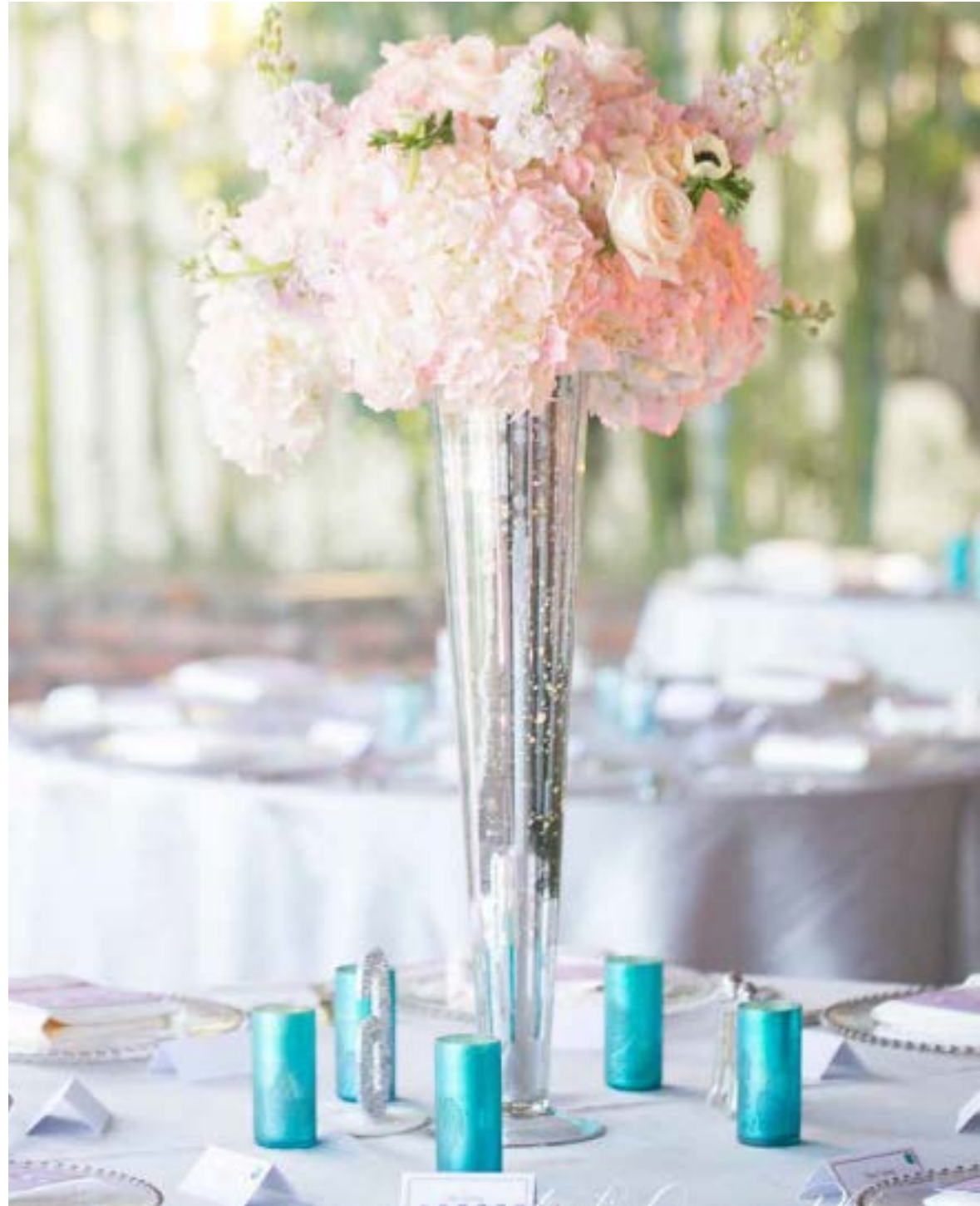
Above: Mercury glass trumpet vases filled with pale pink hydrangeas, anemones, and roses combined with teal glass votives made a dramatic and shimmery tabletop. Opposite: Arthur's handcrafted classic mojito brought a tropical twist of lime and mint to a memorable afternoon.