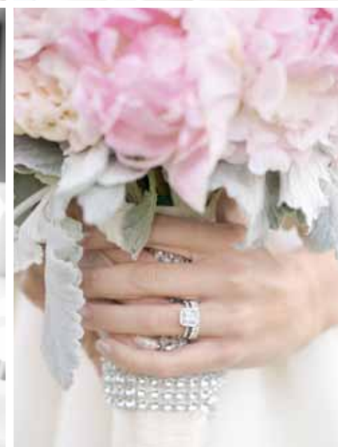
Above: Sophisticated touches of sparkle from head-to-toe complimented Elena's glow of happiness on her most special day. Opposite page: An amazing linen for the head table brought twinkling joy to the sit-down dinner. Touches of pastel pink and teal echoed shades of Casa Feliz's architectural details — creating fairy-tale romance.