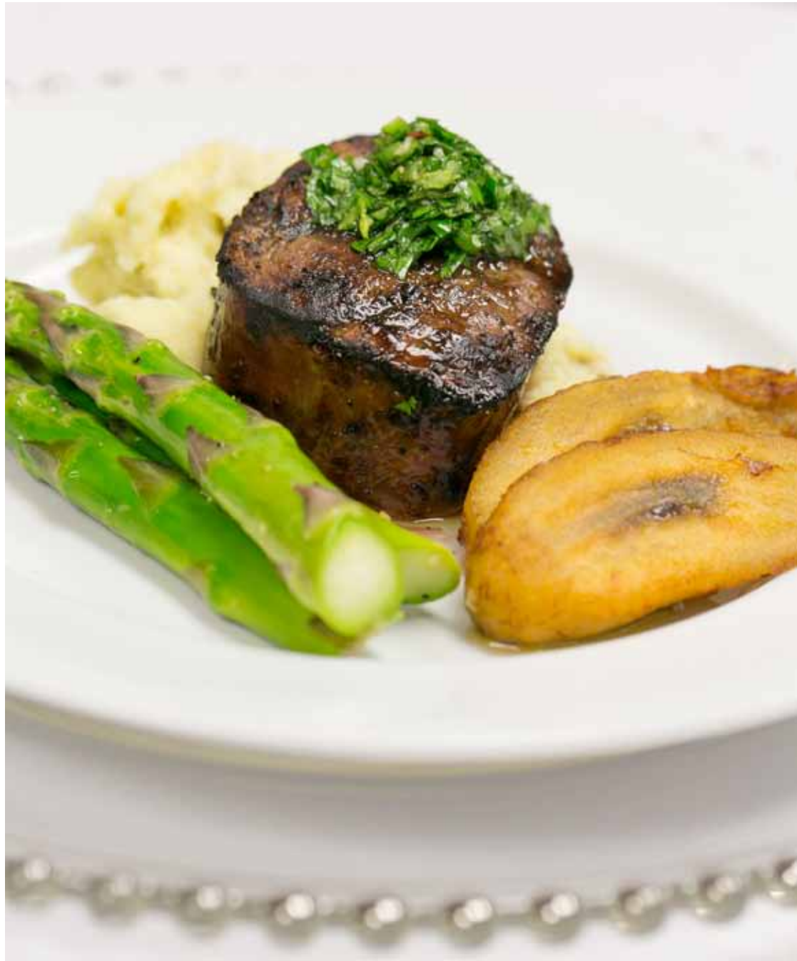
A filet mignon with chimichurri, served with Yukon Gold mashed potatoes, plantains and roasted asparagus took center stage. Opposite: Even the chairs were adorned with just a touch of twinkle and glamour.